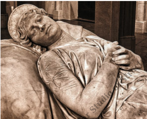
Queen Louise of Prussia funerary monument king Friedrich Wilhelm III Mausoleum Charlottenburg

Louise von Mecklenburg-Strelitz, königin von Preussen, royal consort (Prussia), born 10 Mar 1776, Hannover - died 19 Jul 1810, Hohenzieritz (castle near Neustrelitz) her real name was Louise Auguste Wilhelmine Amalie, grave location, Berlin: Mausoleum of the Schlosspark at Charlottenburg, Berlin, sculpted by C.D. Rauch