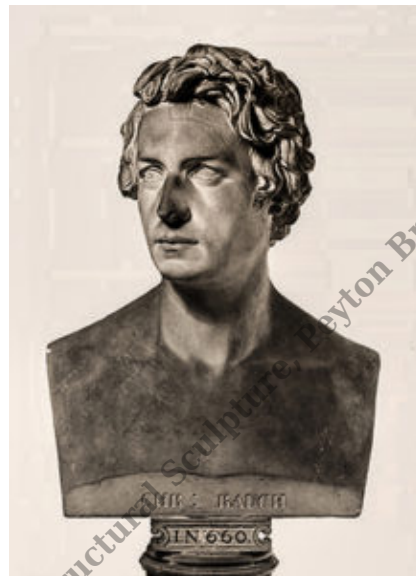
Tieck, Christian Friedrich - portrait bust sculpture by Christian Daniel Rauch

Tieck, Christian Friedrich sculpture by Rauch,