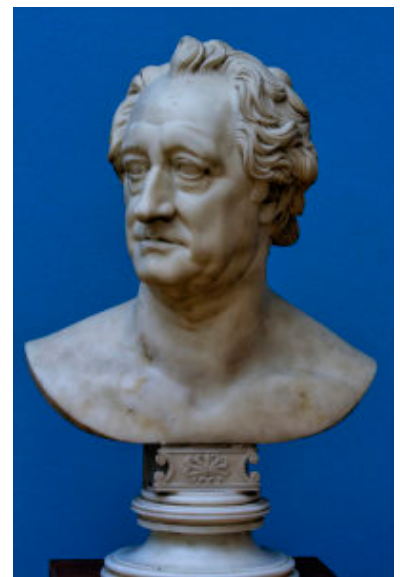
C D Rauch Bust of Goethe, Marble, Leipzig, Germany, marble, Leipzig, Germany