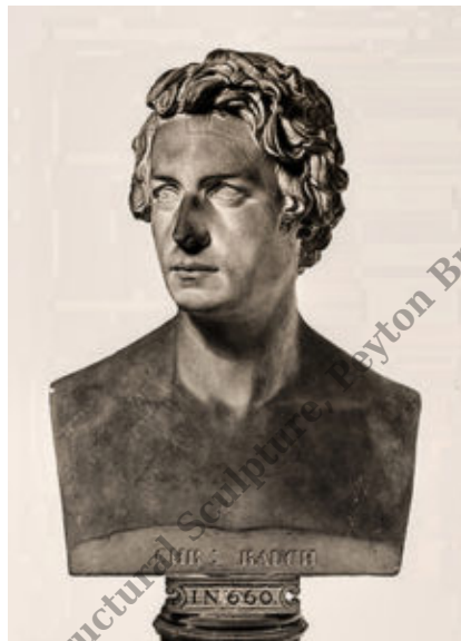
Tieck, Christian Friedrich - portrait bust sculpture by Christian Daniel Rauch

Tieck, Christian Friedrich sculpture by Rauch,