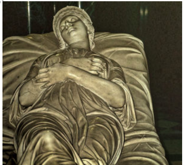
Queen Louise of Prussia funerary monument king Friedrich Wilhelm III mausoleum Charlottenburg, Berlin

Queen Luise of Prussia, Berlin Mausoleum Charlottenburg. Queen Louise of Prussia, Daughter of Karl I, Duke of Mecklenburg-Strelitz. In 1793 she married crown prince Friedrich Wilhelm of Prussia, who became King Friedrich Wilhelm III in 1797.