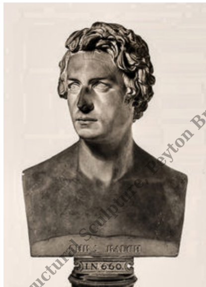
Tieck, Christian Friedrich - portrait bust sculpture by Christian Daniel Rauch

Tieck, Christian Friedrich sculpture by Rauch,