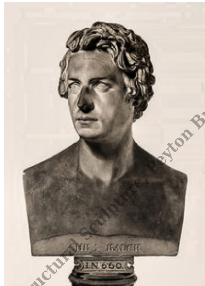
Tieck, Christian Friedrich - portrait bust sculpture by Christian Daniel Rauch

Tieck, Christian Friedrich sculpture by Rauch,