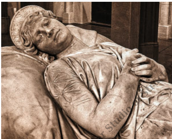
Queen Louise of Prussia funerary monument king Friedrich Wilhelm III Mausoleum Charlottenburg

Louise von Mecklenburg-Strelitz, königin von Preussen, royal consort (Prussia), born 10 Mar 1776, Hannover - died 19 Jul 1810, Hohenzieritz (castle near Neustrelitz) her real name was Louise Auguste Wilhelmine Amalie, grave location, Berlin: Mausoleum of the Schlosspark at Charlottenburg, Berlin, sculpted by C.D. Rauch