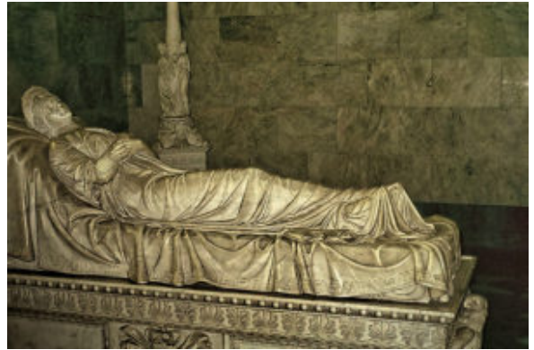
Queen Louise of Prussia funerary monument king Friedrich Wilhelm III mausoleum Charlottenburg, Berlin

Queen Luise of Prussia, Berlin Mausoleum Charlottenburg. Queen Louise of Prussia, Daughter of Karl I, Duke of Mecklenburg-Strelitz. In 1793 she married crown prince Friedrich Wilhelm of Prussia, who became King Friedrich Wilhelm III in 1797.