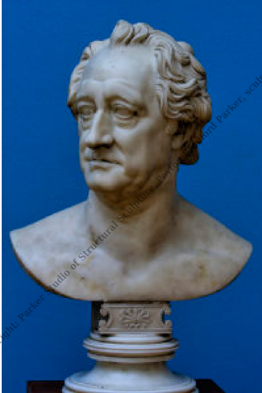
C. D. Rauch - Bust of Goethe, Marble, Leipzig, Germany

Contact: 301 633 2858, or 443 764 5364 by cell phone call, or text message, or contact: