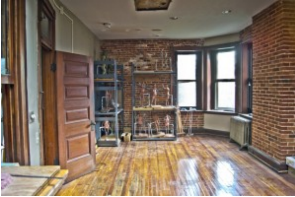
Third Floor Sculpture Studio

Copyright: Parker Studio of Structural Sculpture, Peyton Bradford Parker, sculptor ©