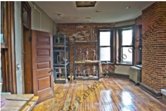
Third Floor Sculpture Studio

$ 15.00 fee each participant - classes - Day / & - Eve.