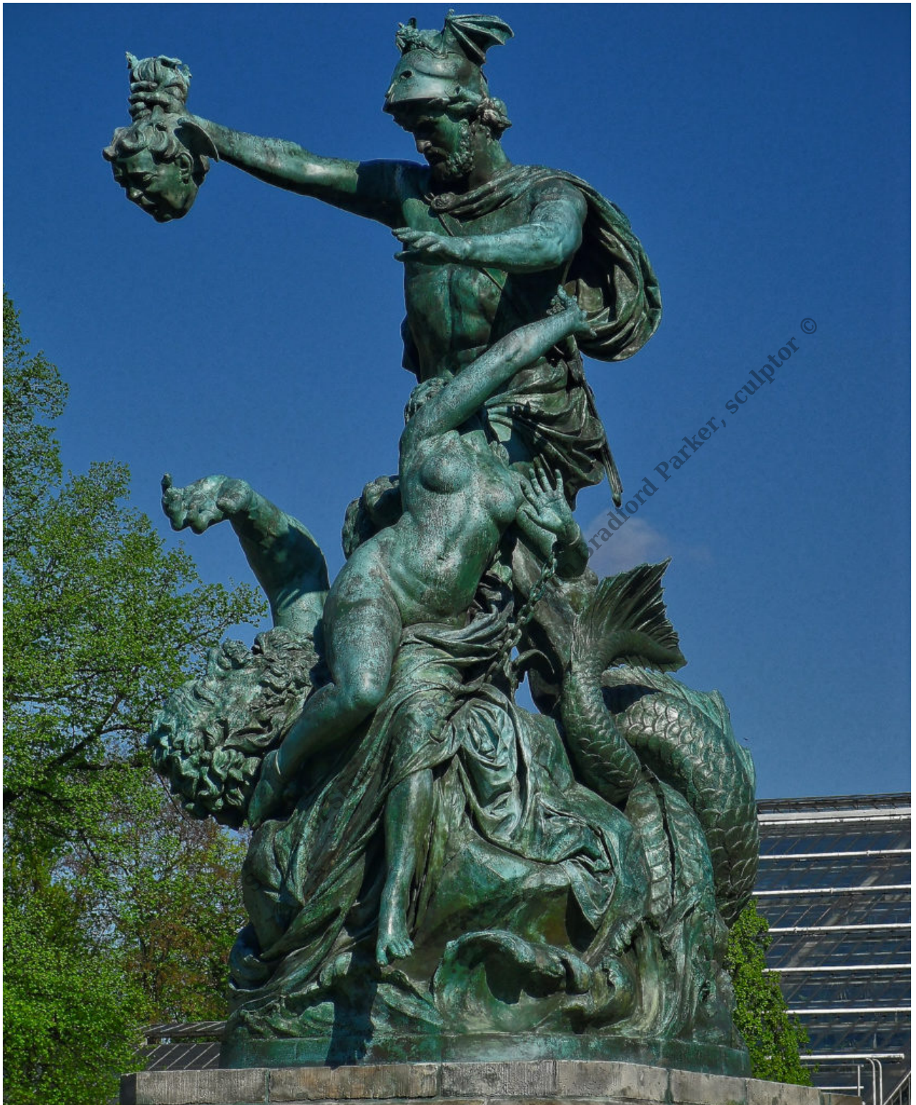
Johannes Pfuhl - bildhauer - Perseus befreit Andromeda ( Perseus liberates Andromeda ), Posen heute im Wilson-Park in Posen Genregruppe Bronze 1882

Participants will have a visual access to a unique and extensive collection. There are Anatomical Models, and European Female, Male Skeletons available for