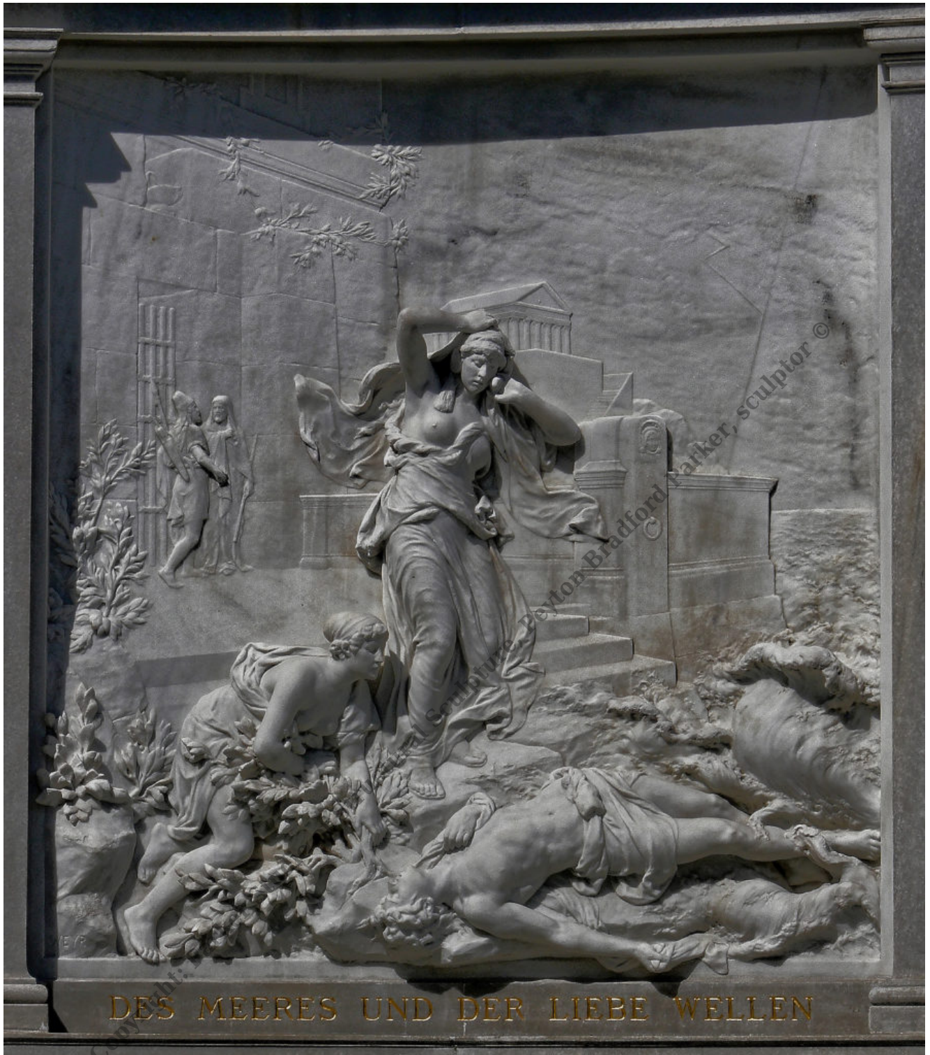
Wien - Grillparzerdenkmal - Relief Des Meeres und der Liebe Wellen - bildhauer: Rudolf Wyr

Participants are responsible for their own materials. Easel, (An alternative to using an easel is to hold a board at the portion on one's legs where they meet the torso, while seated in a chair. The board will then need to be taller than the paper in order to draw at the lower paper portion, away from one's torso, and legs. A thinner thickness Baltic Birch plywood (Baltic Birch hardwood plywood comes in