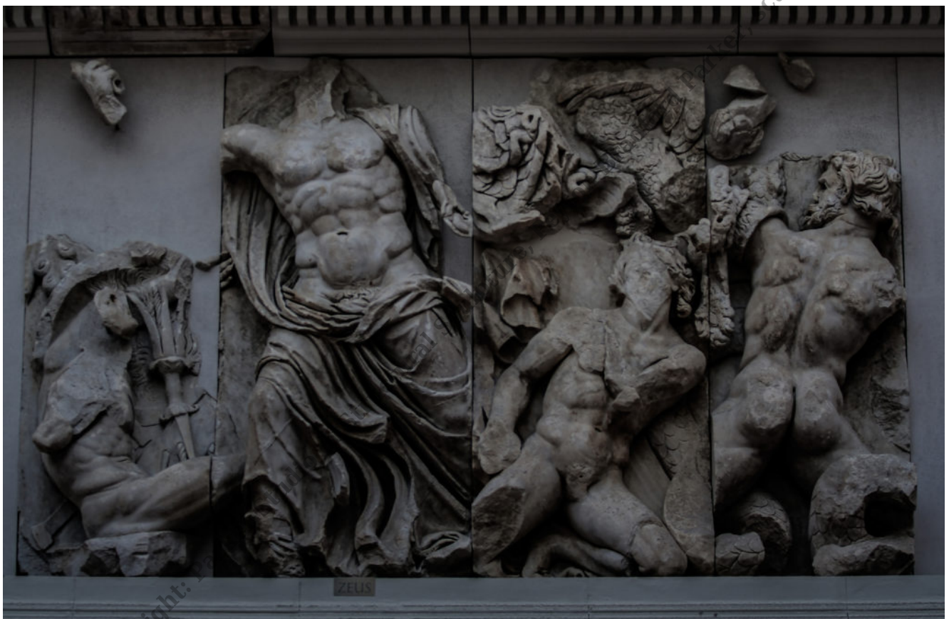
Great Frieze of the Pergamon Altar, 180-159 BC. East frieze. Zeus fights against two young Giants but also against their leader Porphyryon (right), 'Gigantomachy', the struggle between the gods and the giants, Pergamon Museum, Berlin

Private Sculpture Studio, Drawing & Sculpture Classes, By Appointment - Open Drawing & Sculpture Group Sessions, Commissioned Portrait Bust Sculpture, Fountain Sculpture, Figure Sculpture, & Relief Sculpture Compositions. Private Gallery of exhibited sculpture, by appointment only.