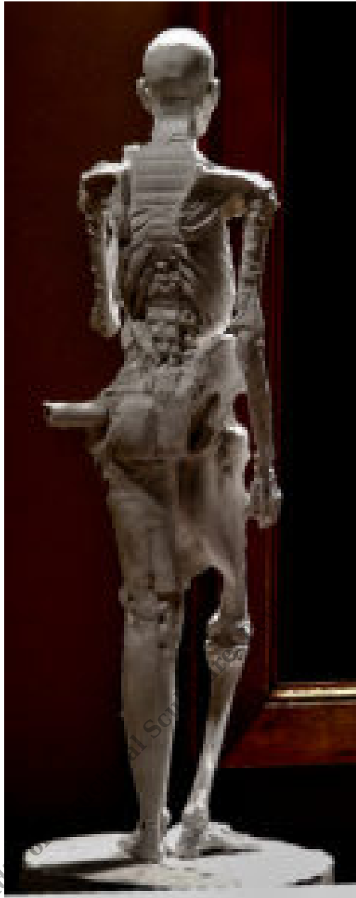
Anatomy Figure Class Demonstration Sculpture, Plaster - unchased - raw, Ana Russian Back View 2