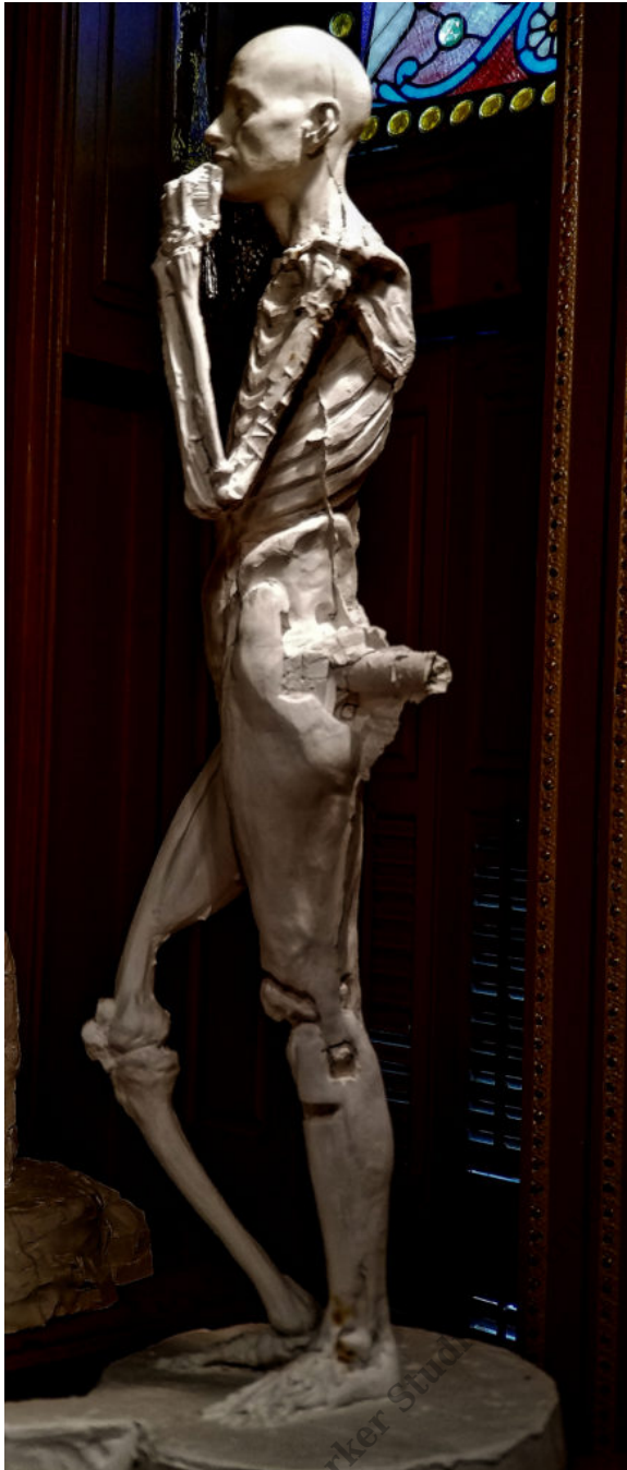
Anatomy Figure Class Demonstration Sculpture, Plaster - unchased - raw, Ana Russian Left Side View 6