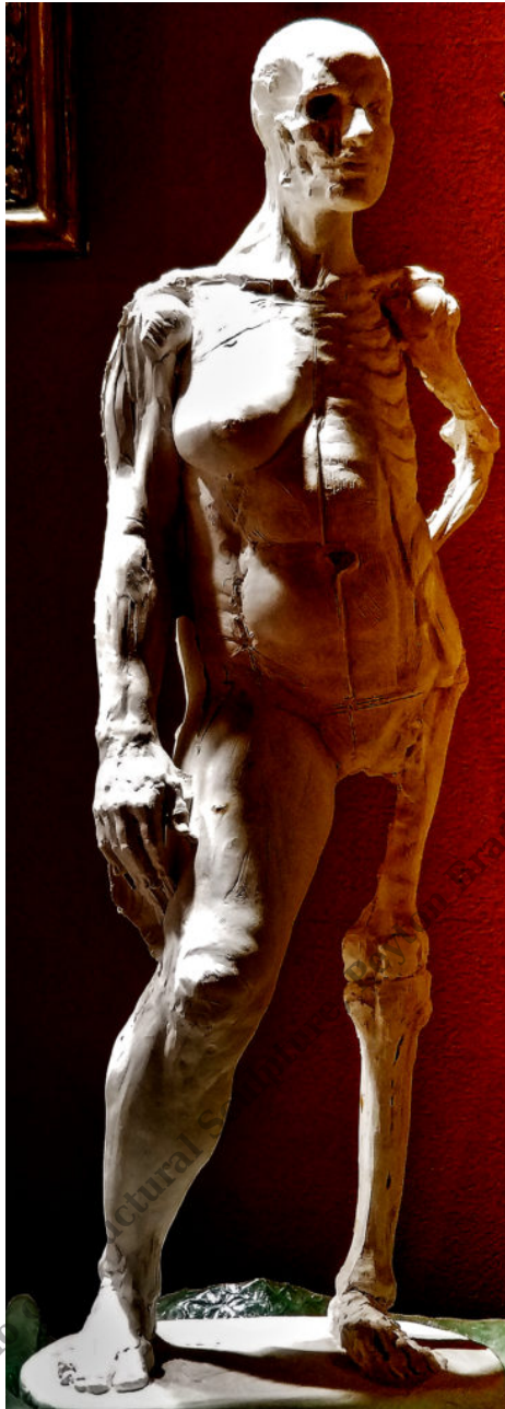
Anatomy Figure Demonstration Sculpture From Class, Plaster - unchased - raw, Anna Prussian Front View 8