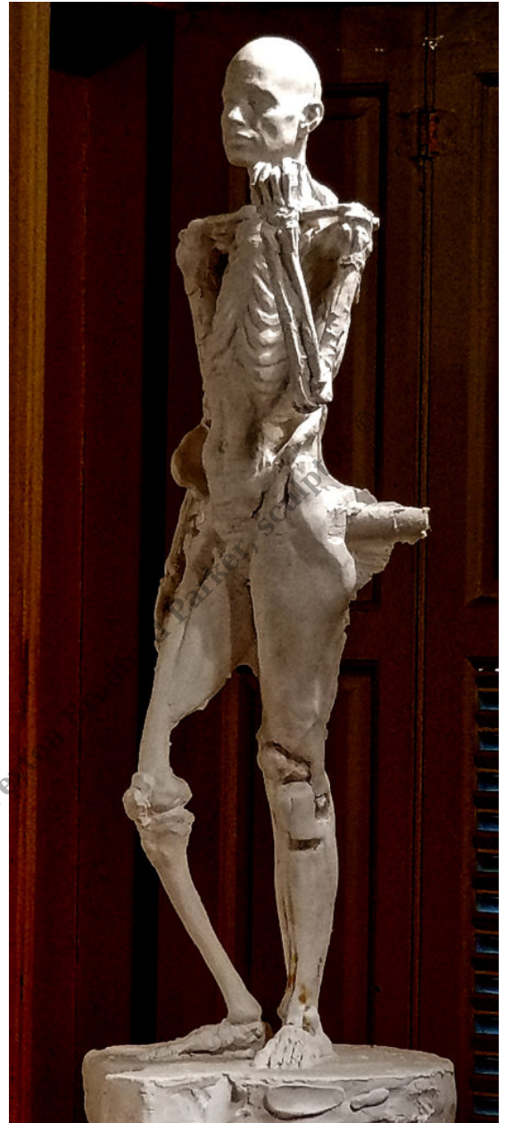
Anatomy Figure Class Demonstration Sculpture, Plaster - unchased - raw, Ana Russian Front Side View 1

Students of painting and drawing, as well as those of sculpture, will benefit from these courses. Through the study of anatomy, running rhythms, natural geometric