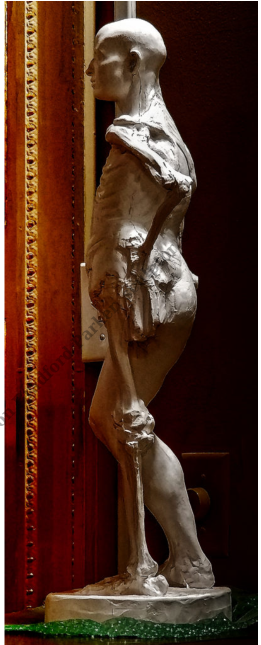
Anatomy Figure Demonstration Sculpture From Class, Plaster - unchased - raw, Anna Prussian Back Side View 4

Copyright: Parker Studio of Structural Sculpture, Peyton, Colorado, USA