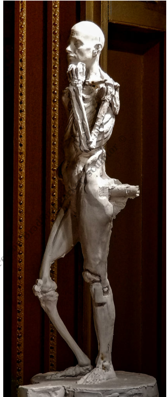
Anatomy Figure Class Demonstration Sculpture, Plaster - unchased - raw, Ana Russian Left Side View 5