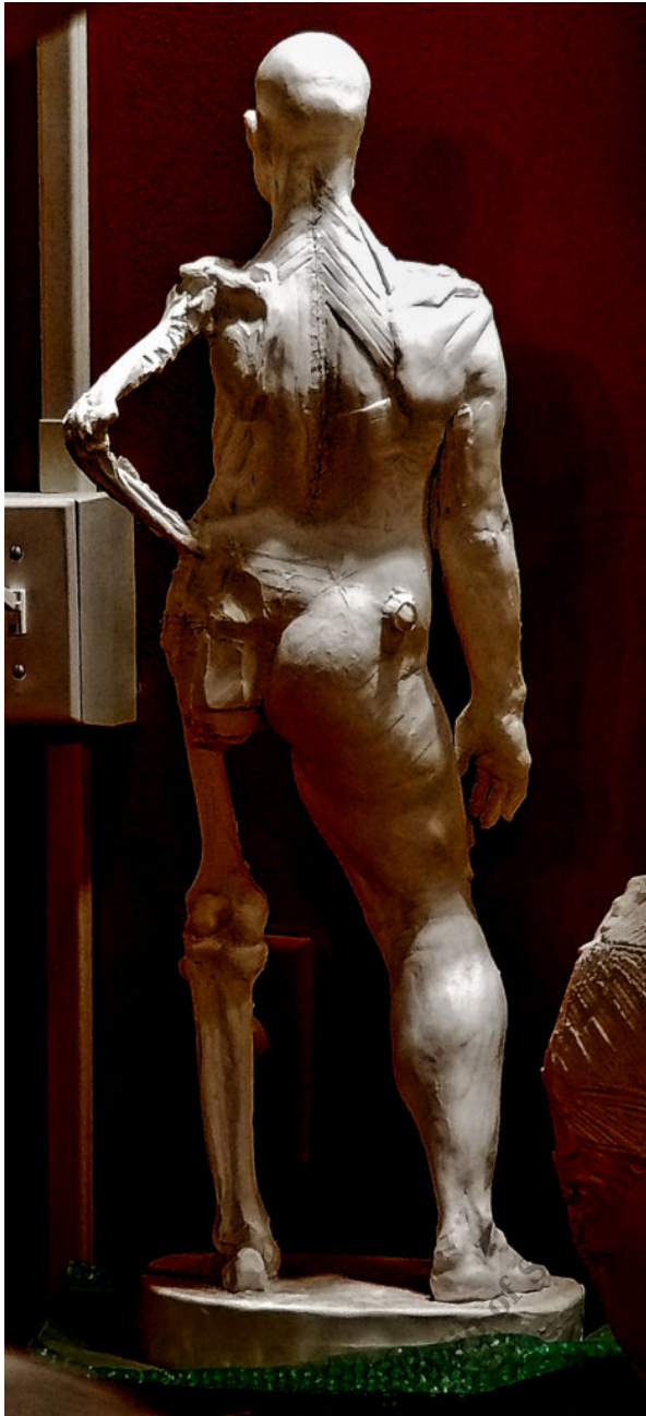
Anatomy Figure Demonstration Sculpture From Class, Plaster - unchased - raw, Anna Prussian Back View 5