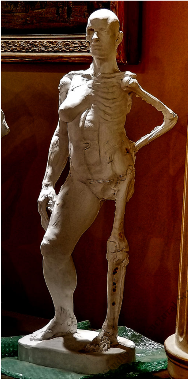
Anatomy Figure Demonstration Sculpture From Class, Plaster - unchased - raw, Anna Prussian Front View Right 9