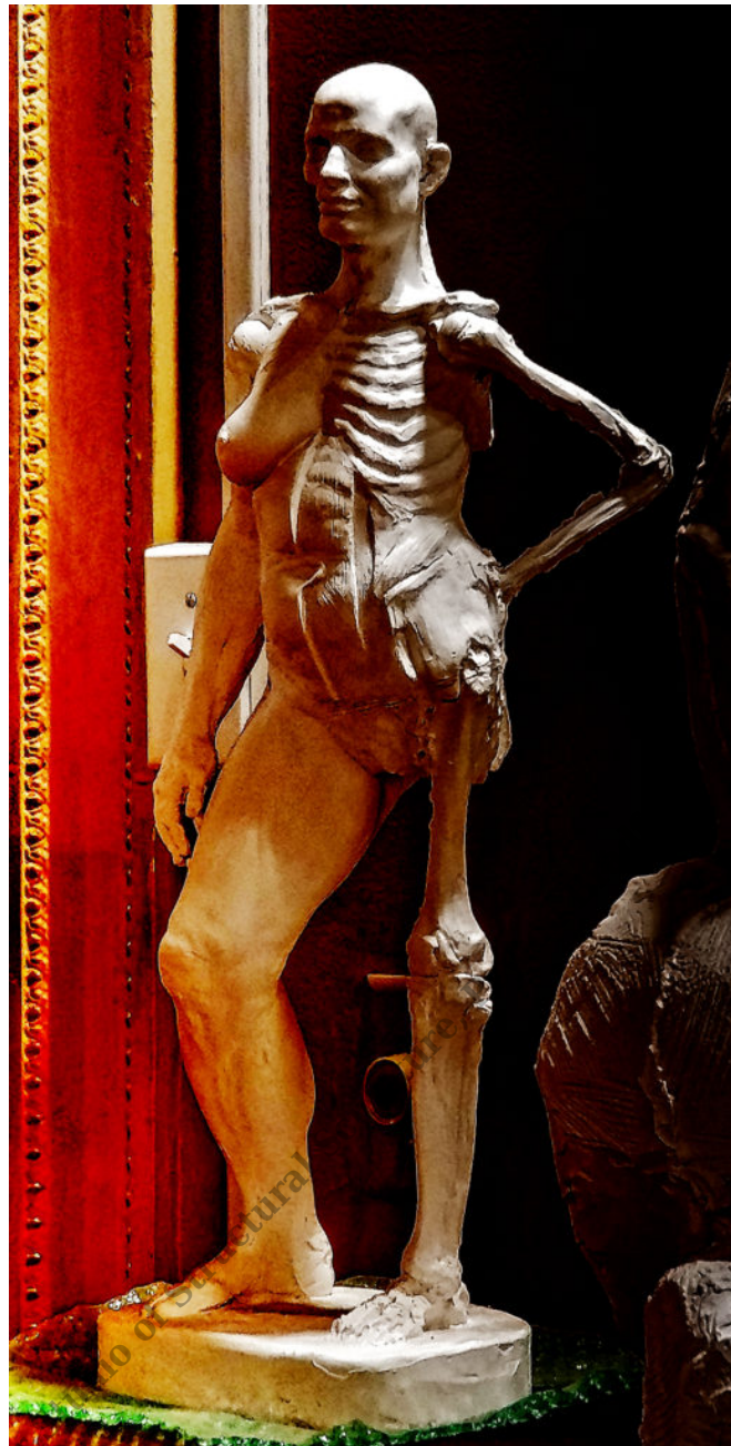
Anatomy Figure Demonstration Sculpture From Class, Plaster - unchased - raw, Anna Prussian Front Side View 7