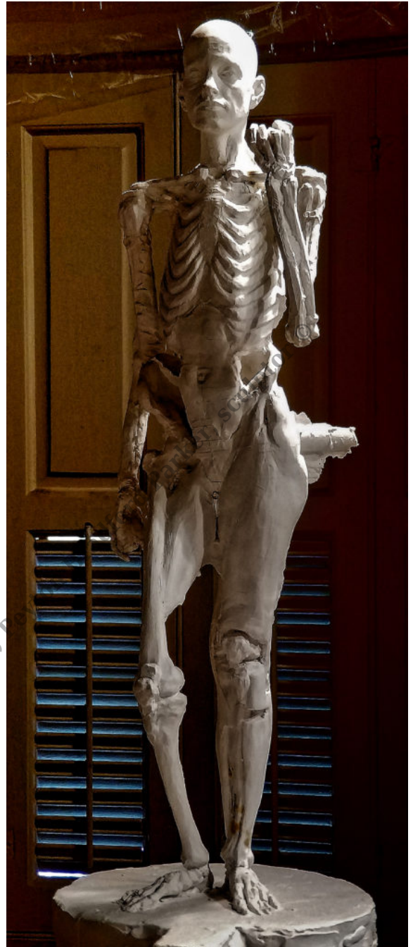
Anatomy Figure Class Demonstration Sculpture, Plaster - unchased - raw, Ana Russian Front View 4