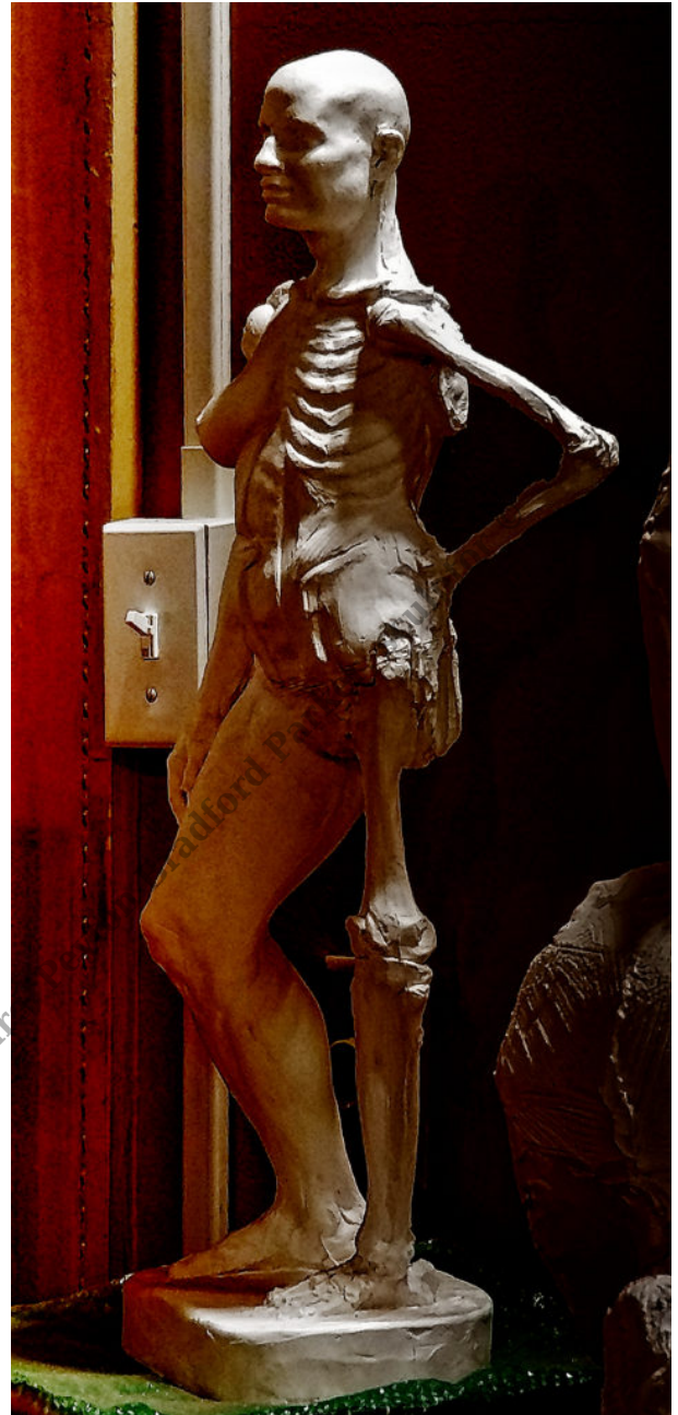
Anatomy Figure Demonstration Sculpture From Class, Plaster - unchased - raw, Anna Prussian Side View 6