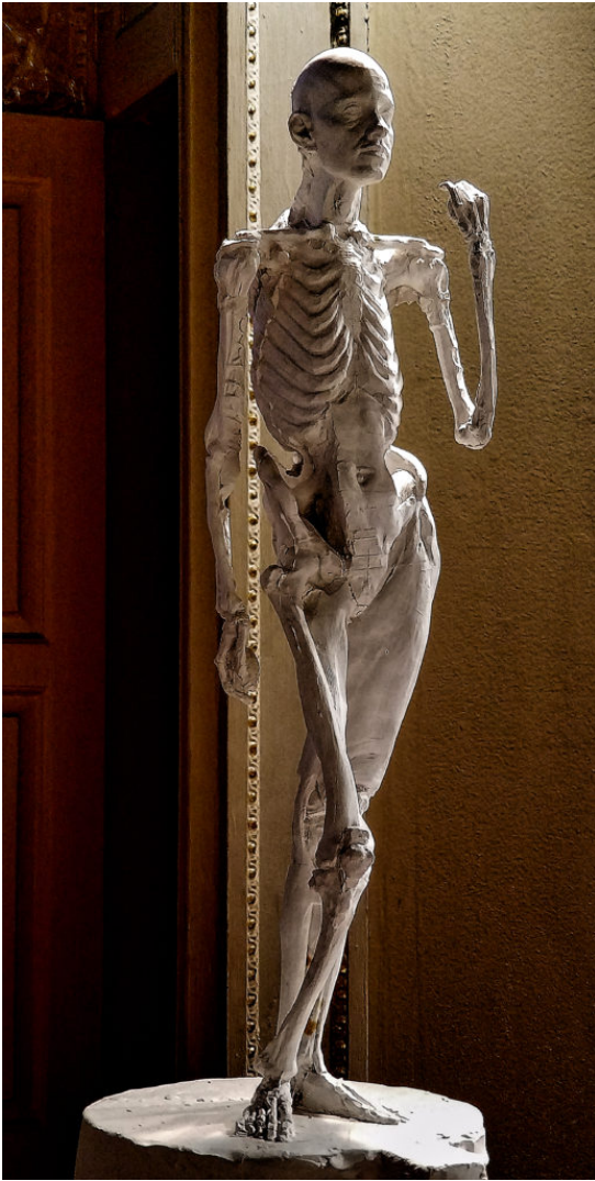
Anatomy Figure Class Demonstration Sculpture, Plaster - unchased - raw, Ana Russian Right Front View 3

Copyright: Parker Studio of Structural Sculpture, Peyton Bradford Parker, sculptor ©