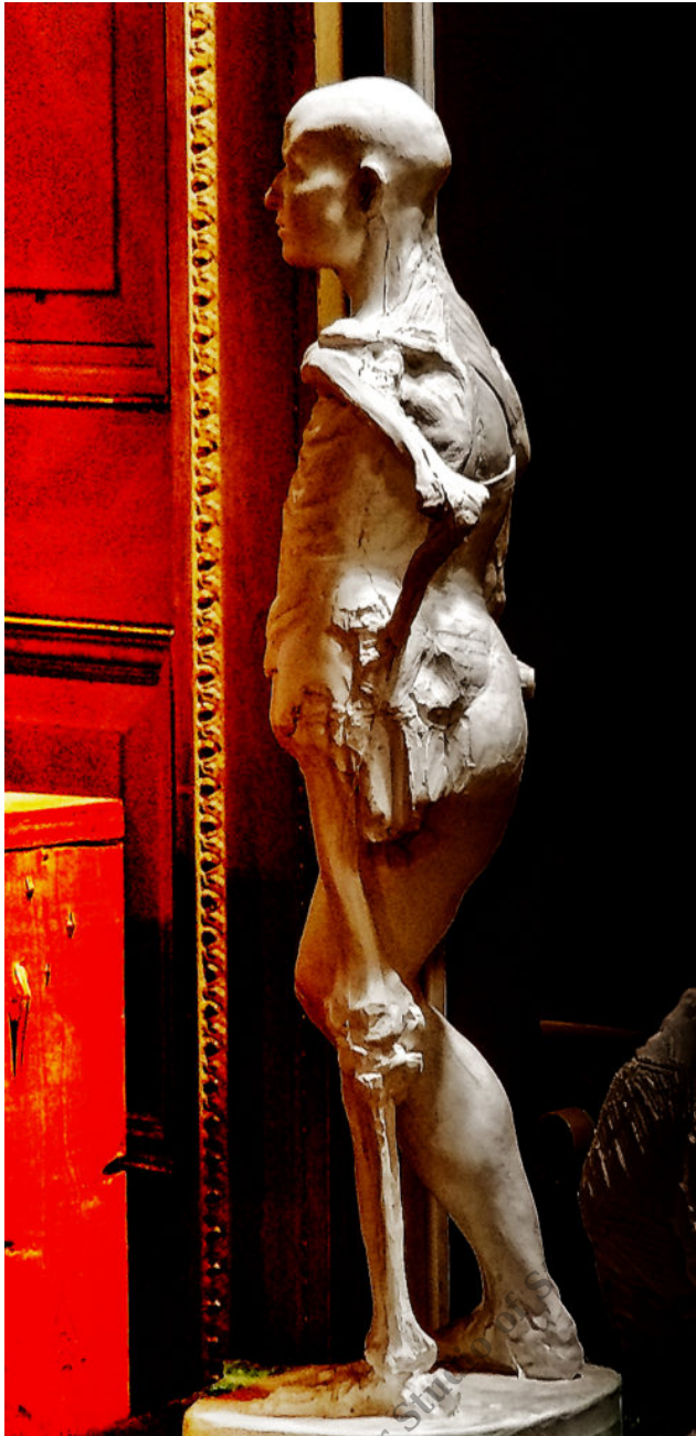
Anatomy Figure Demonstration Sculpture From Class, Plaster - unchased - raw, Anna Prussian Back Side View 3